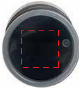
LOCATION 1: TOP